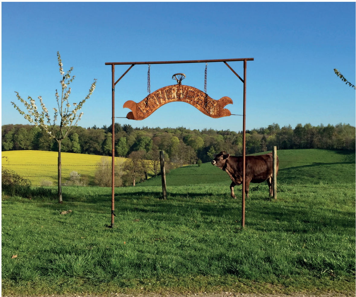
Beate Engl: Lonebase, kinetic installation, 2013