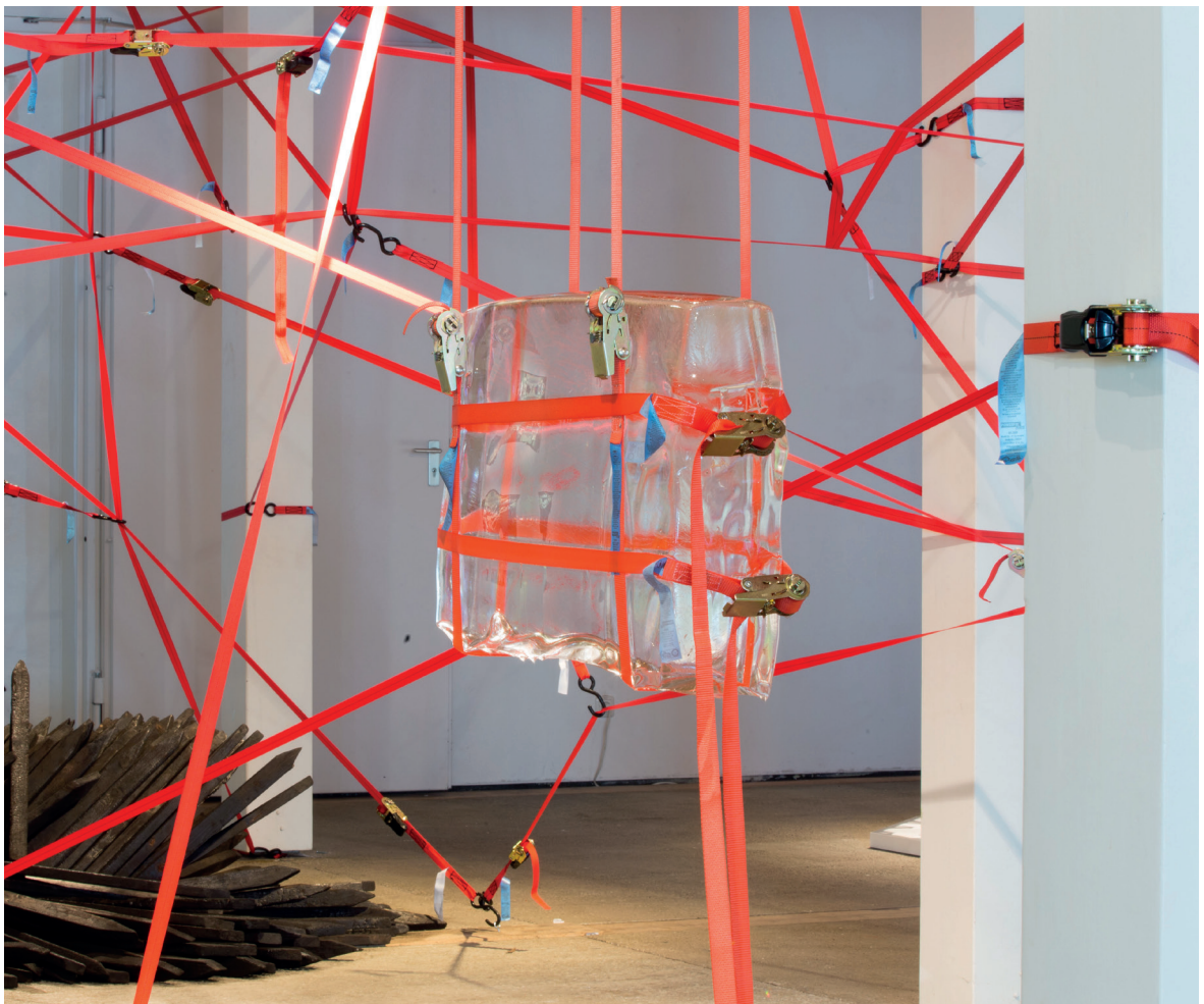
Jure Markota (SLO): , exhibition Transfer > Slovenia , 2013