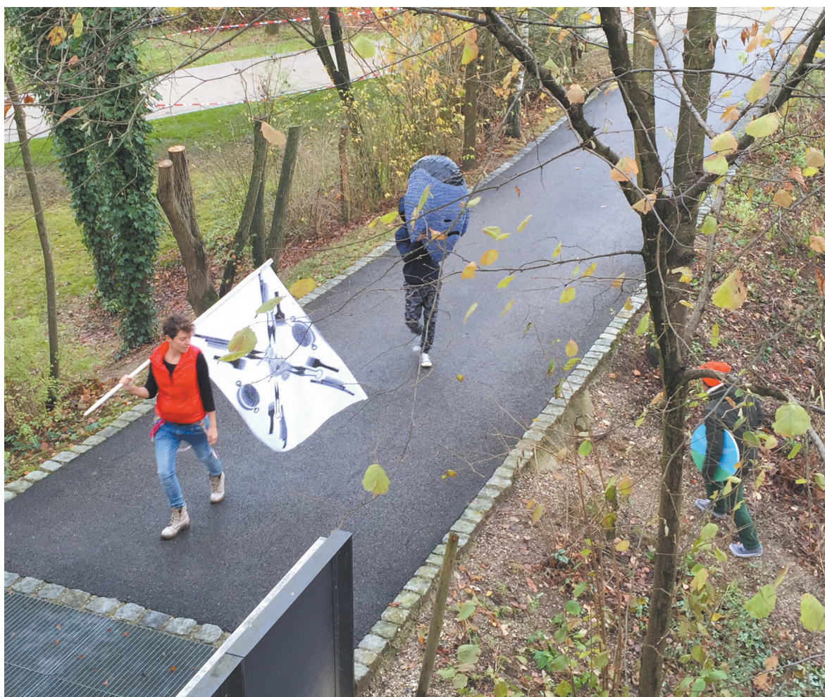
Transfer > Ukraine II, 2015