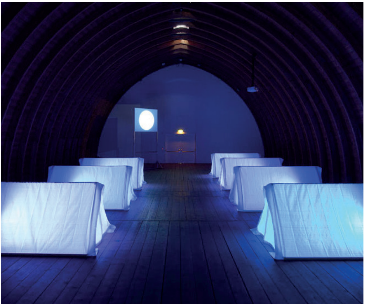
Bjørn Melhus: Nightwatch , 2013